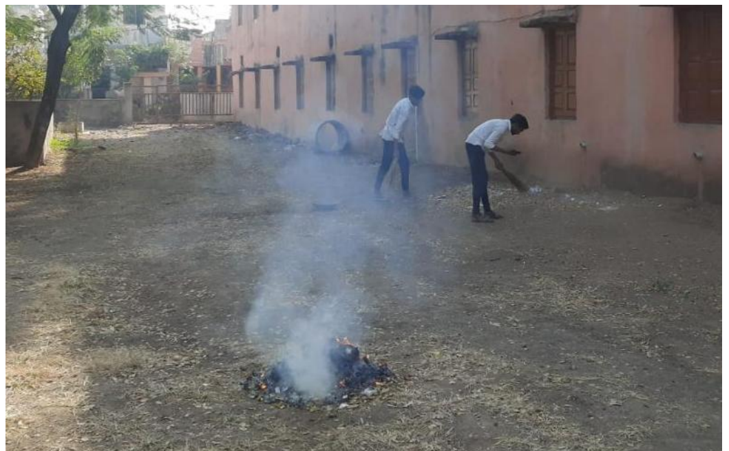
NSS Volunteers performing cleaning at college campus