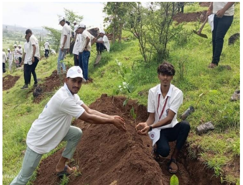
Participation of NSS volunteers from Vasantnao Naik College, in Vice Chancellor Summer Camp at Tribal Academy, Nandurbar.