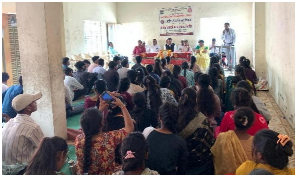
Hon. Dignitary and villagers attending closing ceremony of the NSS Camp.