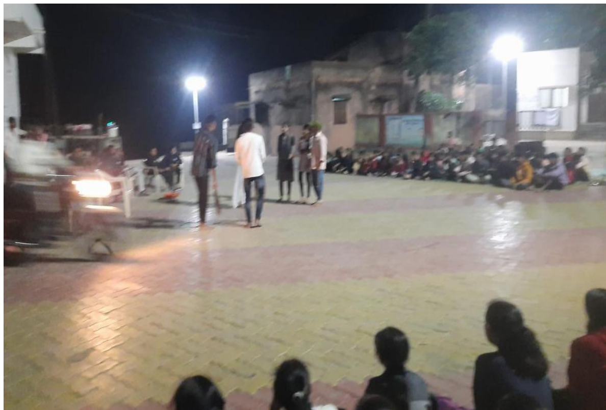
NSS Volunteers presenting street play on digital literacy.