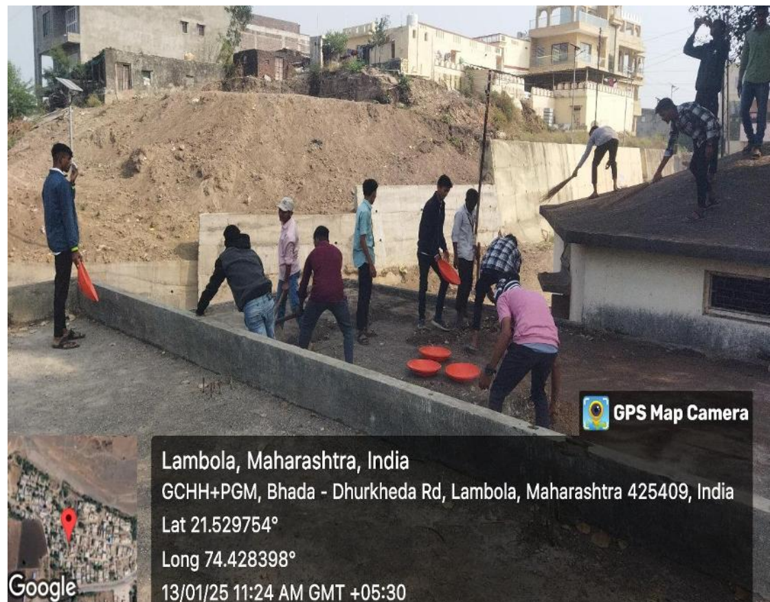
Volunteers cleaning at Z. P. Primary School campus