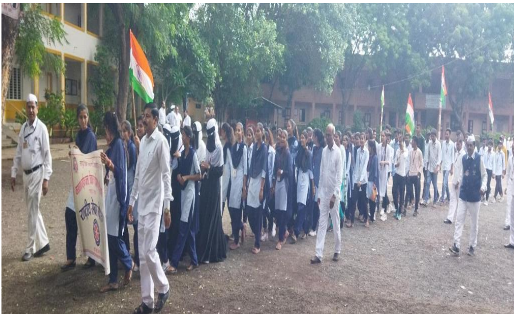
Celebration of Independence Day.