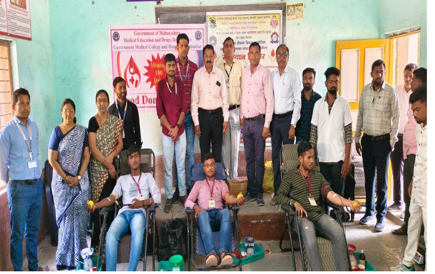
Blood Donation Camp at Vasant Rao Naik College, Shahada.