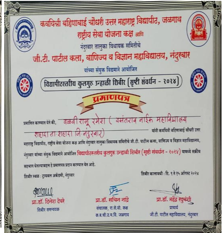
Vice Chancellor Summer Camp participation certificates