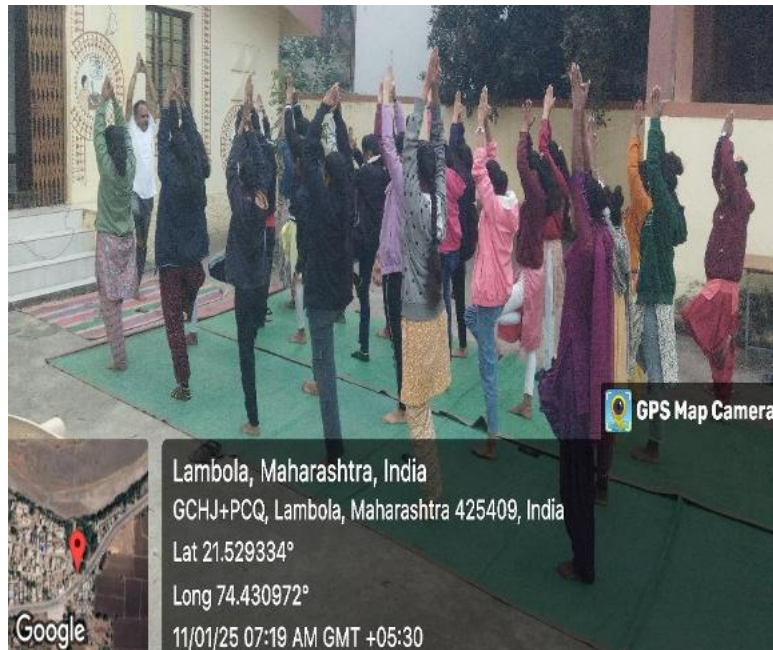
NSS Volunteers performing Yoga activity