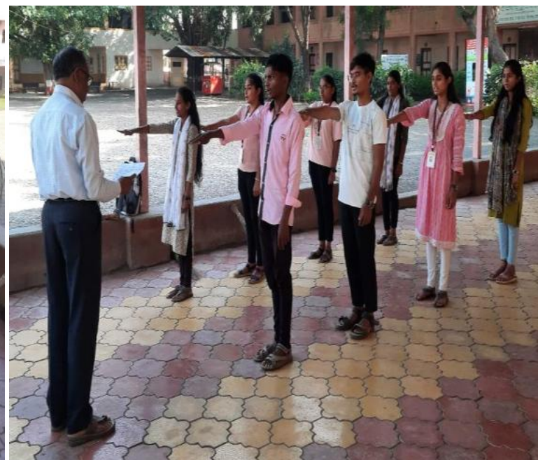
NSS Volunteers taking a pledge to celebrate a Crackers Free Diwali