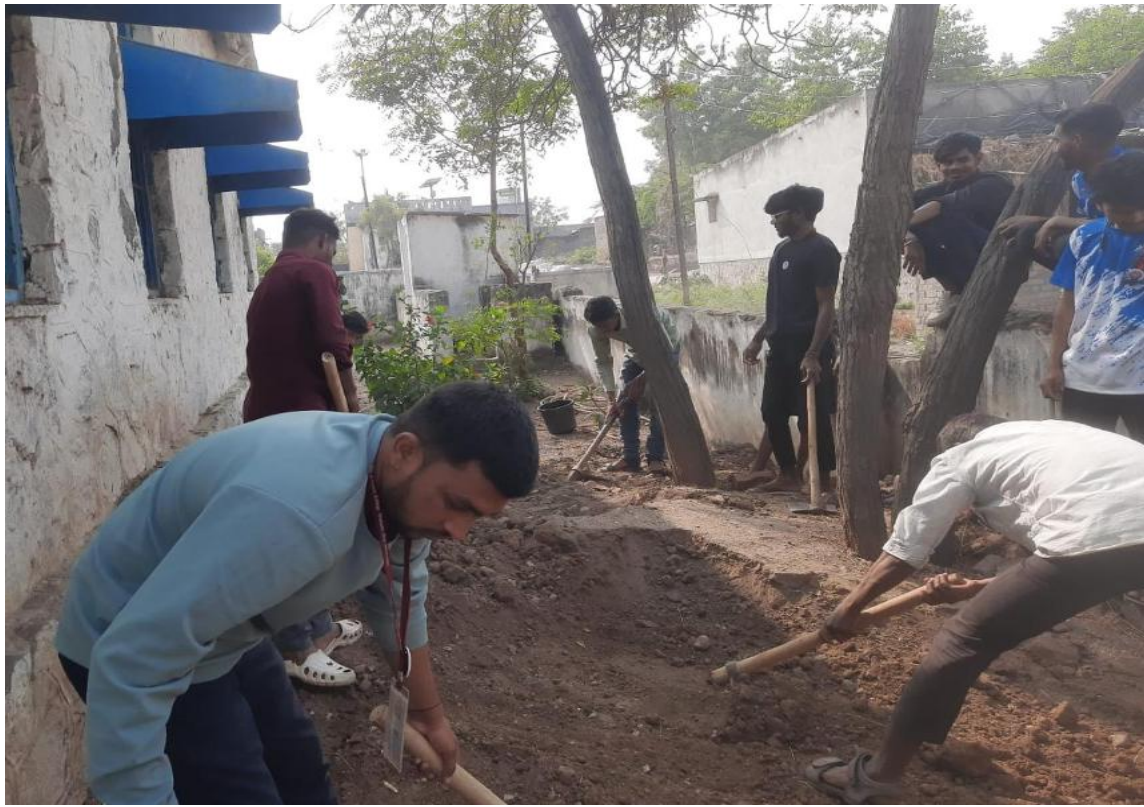
Shramdan Activity by Nss Volunteers