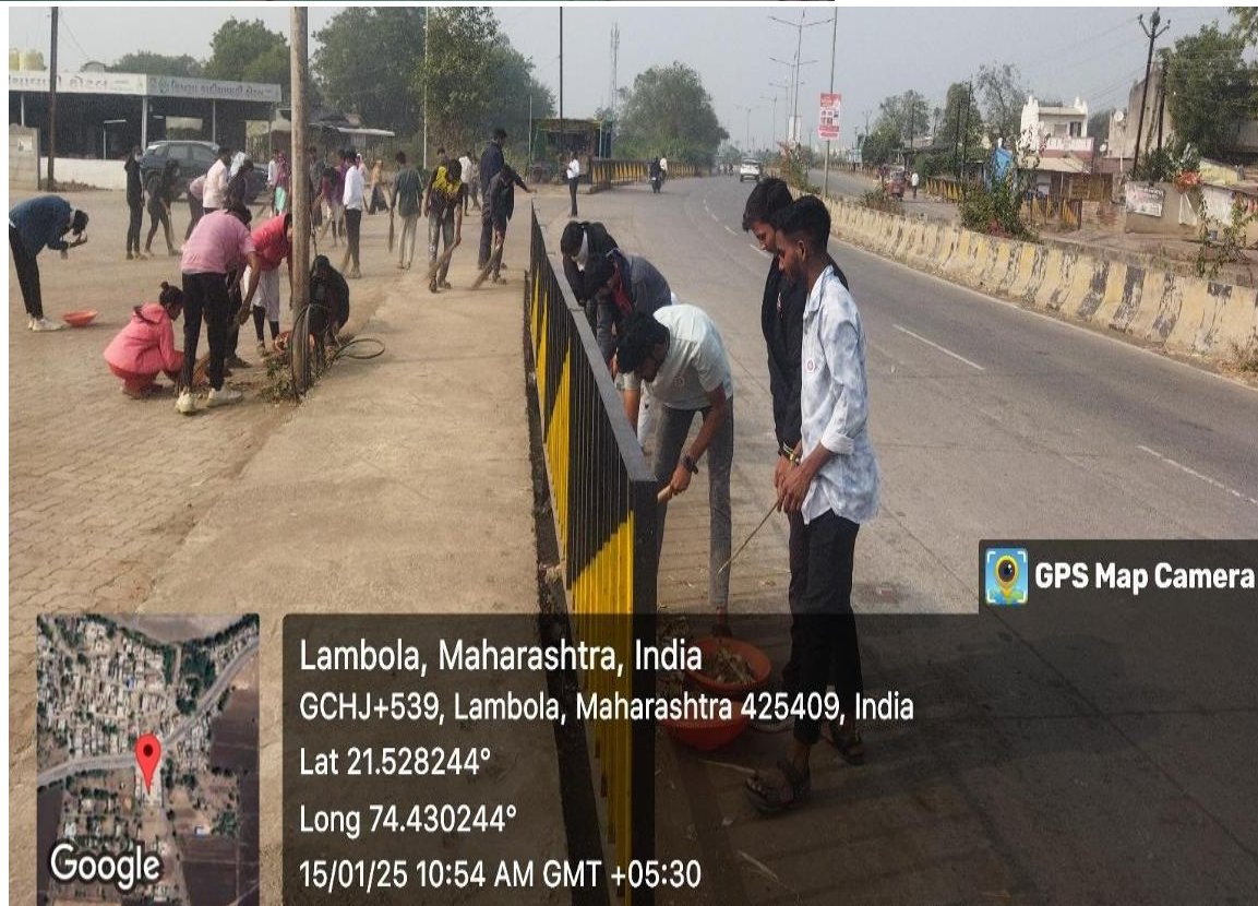
Main road cleaning at village Lambola