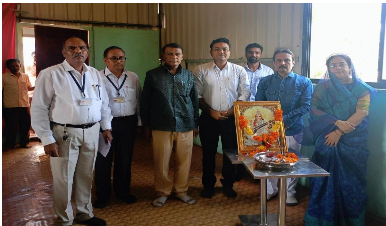
Inauguration of NSS Volunteers Orientation Programme.