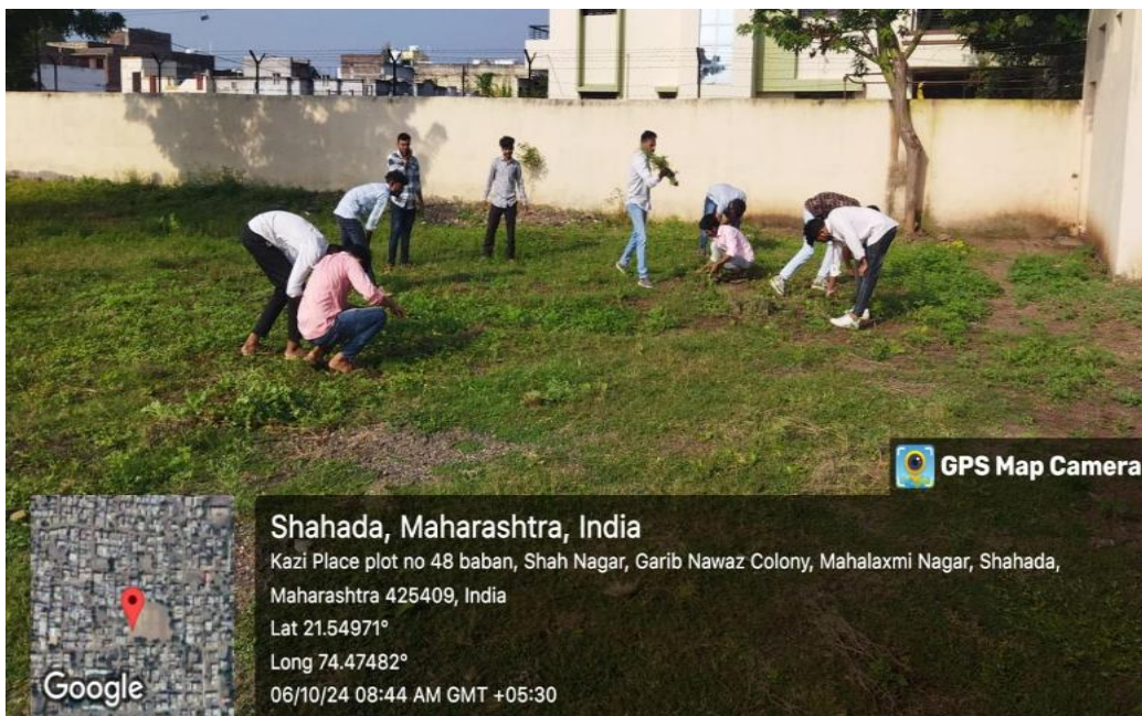
cleaning and removing weeds at college ground