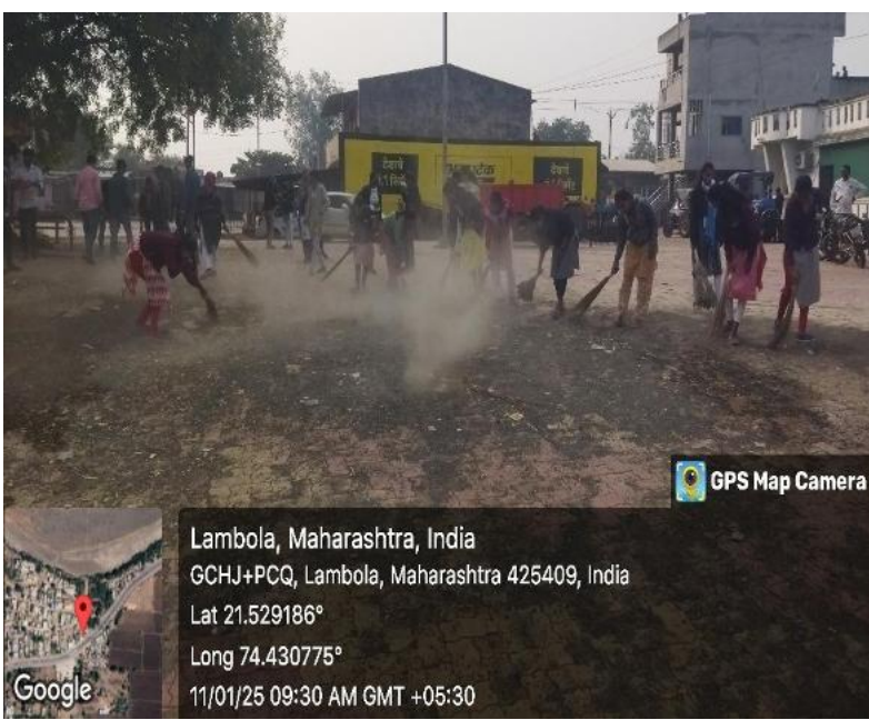
NSS Volunteers Cleaning water source premises at village Lambola.