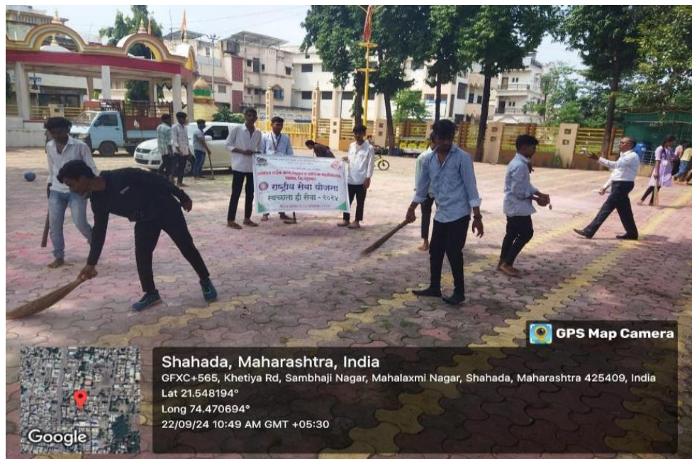
Participation of NSS Volunteers in "Swachhata Hi Seva" Initiative