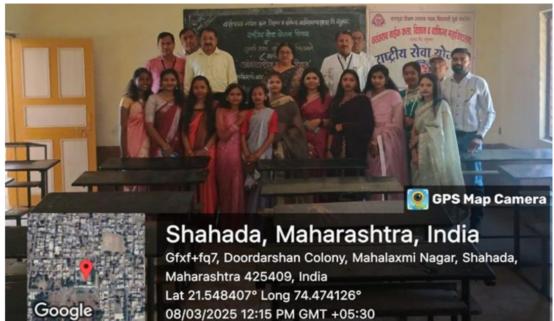
Celebration of International Women's Day