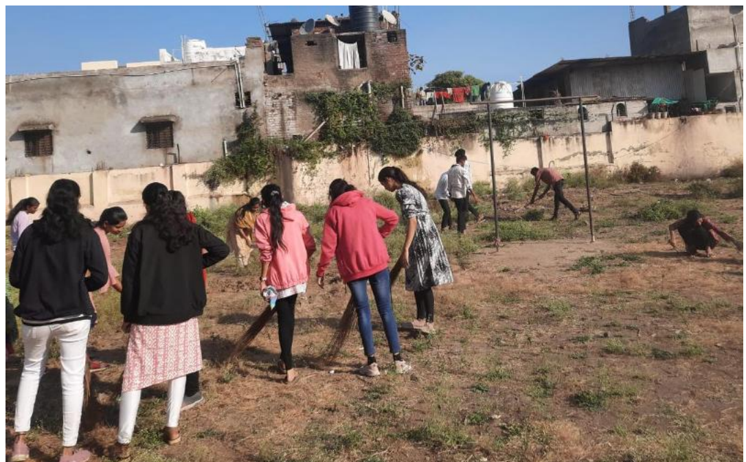
NSS Volunteers cleaning College ground