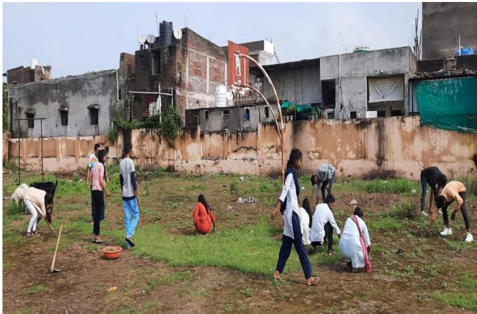
NSS Volunteers Cleaning the college ground.